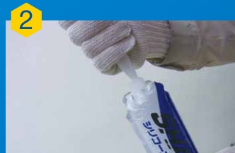
Use a nozzle and make a hole on the head of pouch