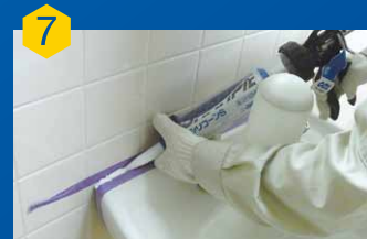
Pull trigger and dispense Sealant