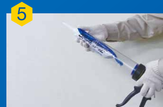
Insert the SK pouch into an applicator