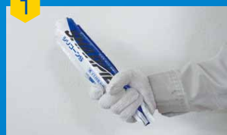
Squeeze the bottom of the SK pouch