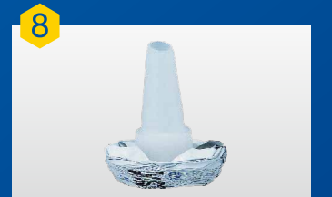
When completely used, pouch can be compressed and easily disposed