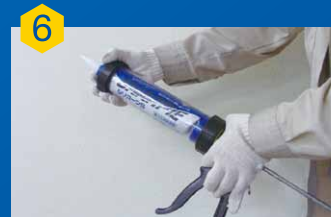
Close the cap of the applicator