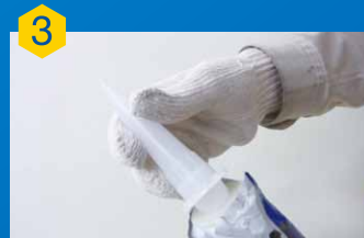
Attach the nozzle