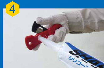
Cut the nozzle